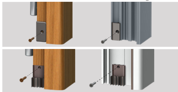
Frame with ribbing

BUTTON (F): hexagonal brass, square nylon, bevelled nylon, rolling nylon (pivot). GASKET: silicon tubular. SCREWS: particleboard 3.5 x 25 mm.