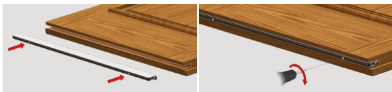
With pre-mounted screws

Mechanism with a single adjustment (screw F: descent) characterised by the controlled movement of the moving profile with gasket (immediate descent from the hinge side of the door and consequent gradual descent for the entire length) for adjustment to the floor.